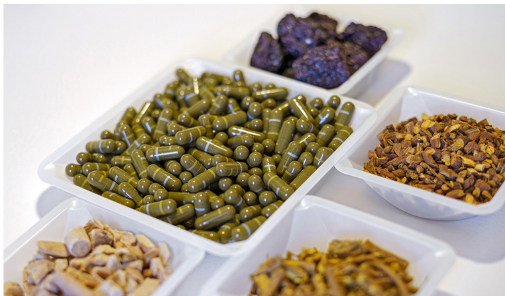
The botanical drug YIV-906 (center) is developed from an 1800-year-old Chinese formula and relies on four naturally derived ingredients: licorice, skullcap, peony, and dates.

In 2019, Cheng and his research partners ran a study with Yale immunobiology professor Lieping Chen (https://cancerres.aacrjournals.org/content/79/13_Supplement/2252) to test YIV-906's effectiveness with Chen's immunotherapy drug anti-PD1, and found that YIV-906 enhanced the immunotherapy drug's anti-tumor property. The combination of the drugs not only eradicated all tumors in mice, but when new tumors were implanted, the tumors did not grow. This suggested that YIV-906 with anti-PD1 "created a tumor-specific vaccine-like effect," they wrote in their study.